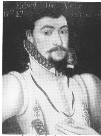
From the portrait by Marcus Gheeraerts, c. 1590, National Portrait Gallery, London

The same type of challenge to long-held “truth” by “experts” is also occurring in literary circles, posing a threat to tenured professors in English departments at prestigious universities. The challenge is